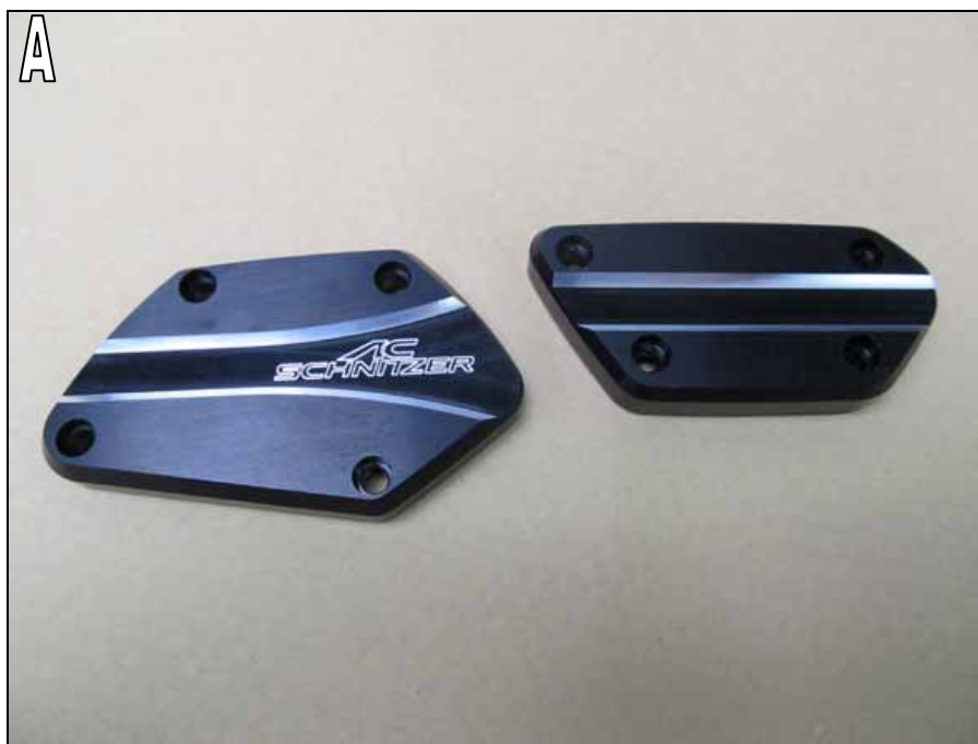
A AC Schnitzer "Heritage" Cover Set